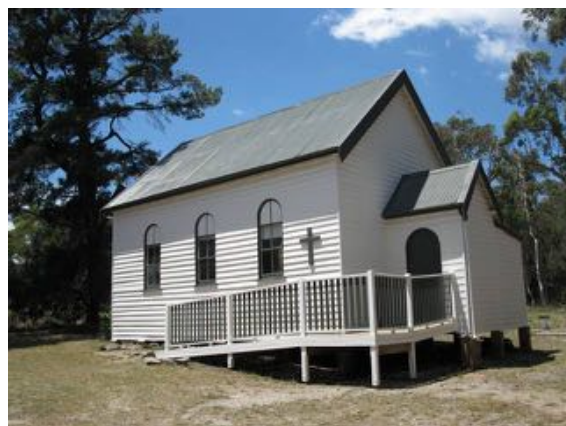
Tallong's St Stephen's Anglican Church.

Infant and preschool children from Tallong, Marulan, Wingello, and Penrose are invited to enter the Apple Granny Art competition by producing an artwork banner with a Welcome to Tallong theme.