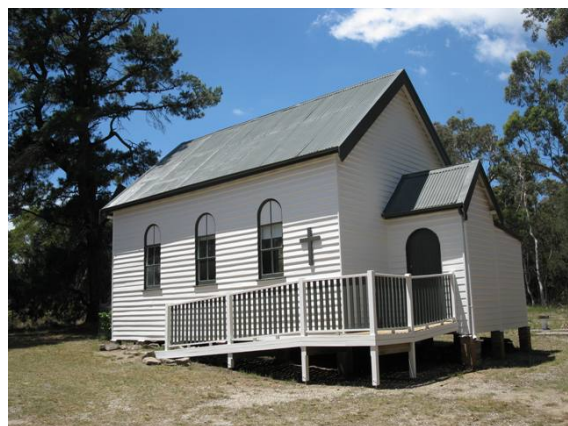
Tallong's St Stephen's Anglican Church.

Infant and preschool children from Tallong, Marulan, Wingello, and Penrose are invited to enter the Apple Granny Art competition by producing an artwork banner with a Welcome to Tallong theme.