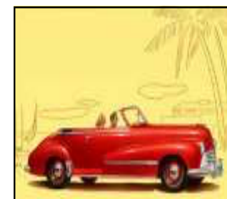
SHOW & SHINE