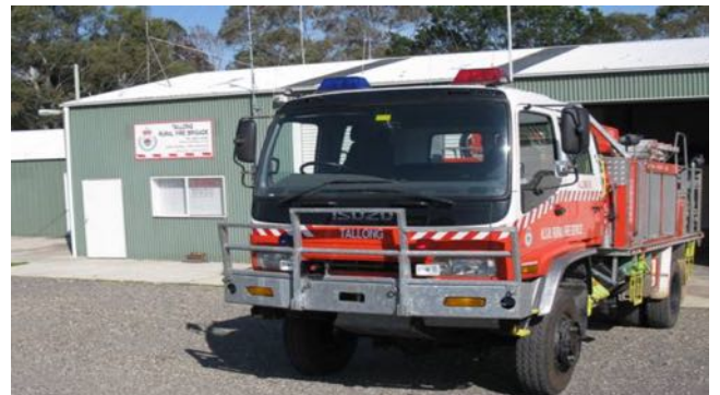
Tallong Fire Shed, Memorial Drive, Tallong with Tallong 1 Bravo out the front.