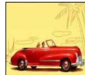
SHOW & SHINE