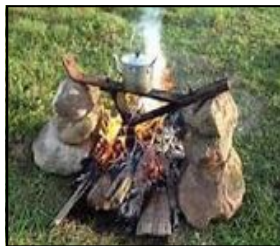
BILLY BOIL CUP